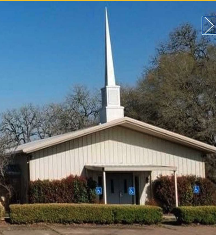
Union Grove Baptist Church, Whitehall, Texas